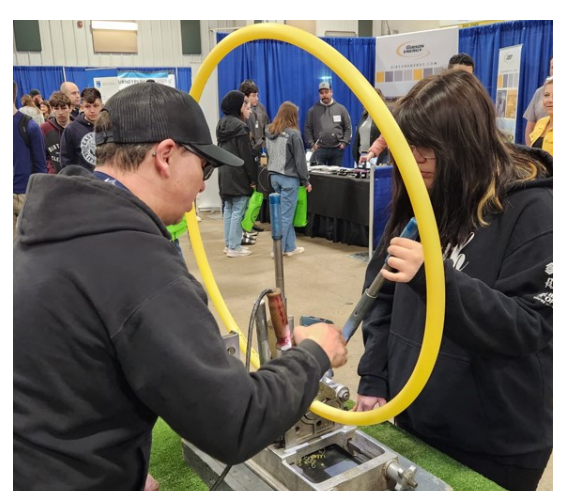
County Gas at the 2023 Try-A-Trade

To Submit a request: Call 1-800-242-3447 or Visit utilitysafety.ca